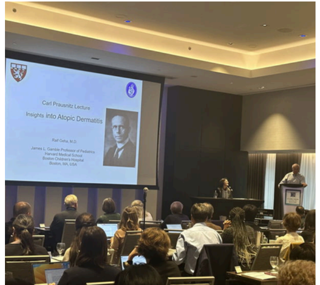
2023 CIA Biennial Symposium Carl Prausnitz Lecture Montreal, Canada