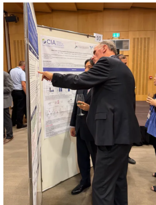
2025 CIA Biennial Symposium Poster Reception Dubrovnik, Croatia