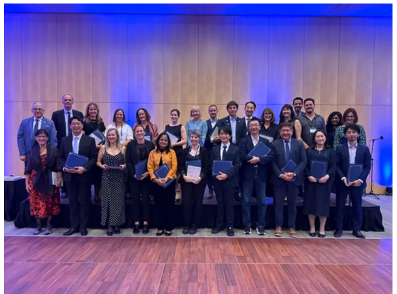
2025 CIA Biennial Symposium Inducted Members Dubrovnik, Croatia