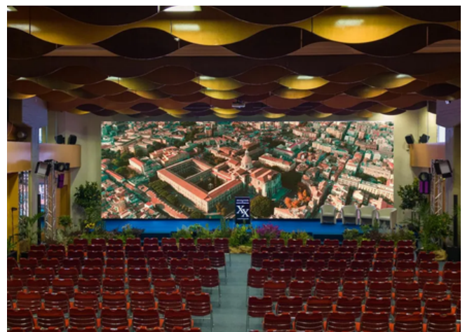
General Session Room, Four Points by Sheraton Catania