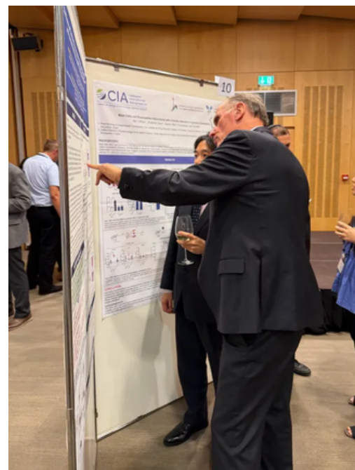
2025 CIA Biennial Symposium Poster Reception Dubrovnik, Croatia